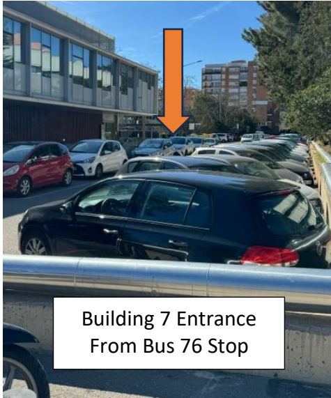
Building 7 Entrance From Bus 76 Stop