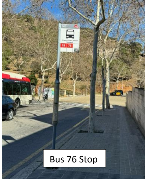
Bus 76 Stop