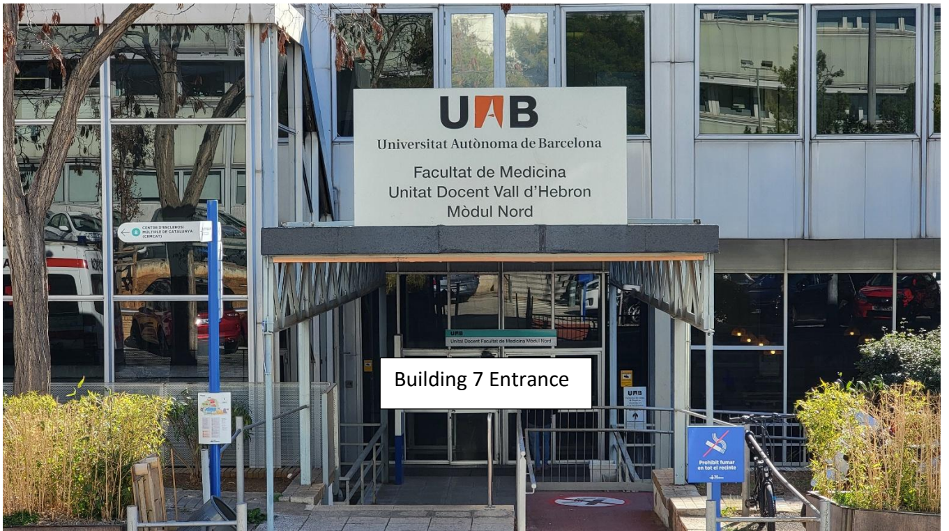
Building 7 Entrance