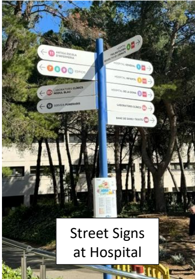
Street Signs at Hospital